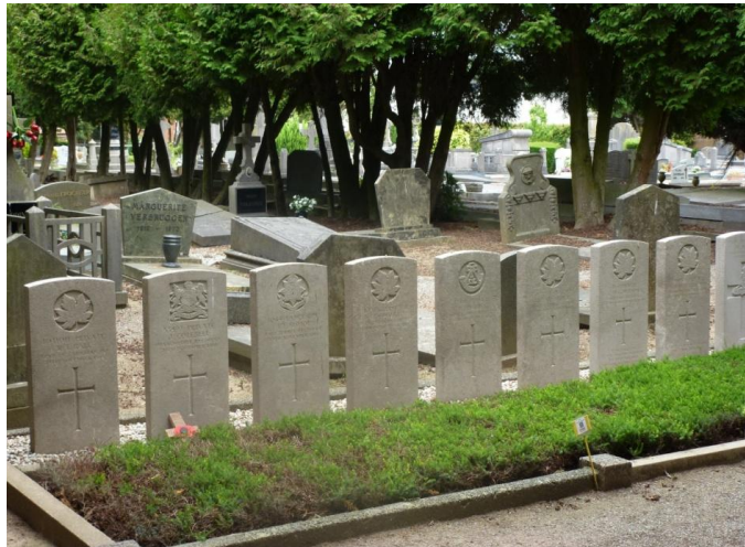
Graves of nine WW1 soldiers in Gosselies Communal cemetery