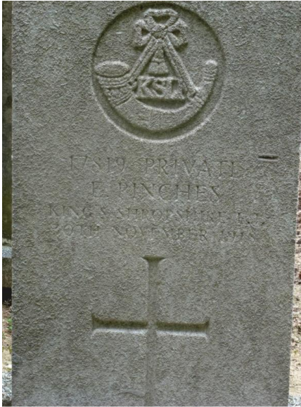
E Pinches in Gosselies Communal cemetery

It then became part of the army of occupation in the Rhineland. Fifty-three officers and 986 other ranks were killed during the war.