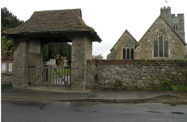
Lynch Gate, All Saints Church, Wouldham, Rochester, Kent

He is buried at the Bailleul Communal Cemetery Extension, Nord, Pas-de-Calais, France, Plot: II. B. 251, northwest of Armentières. 20,21