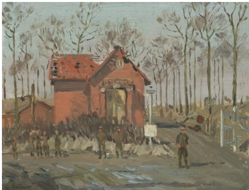
"Red Lodge, Hyde Park Corner, Ploegsteert, November 1917," Australian War Memorial ( https://www.awm.gov.au/ : accessed 27 November 2018)